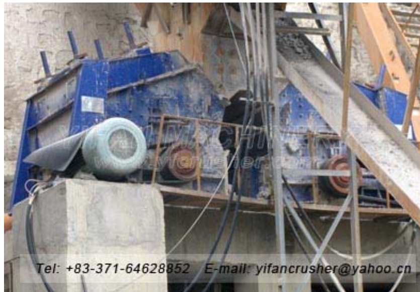
Impact crusher case